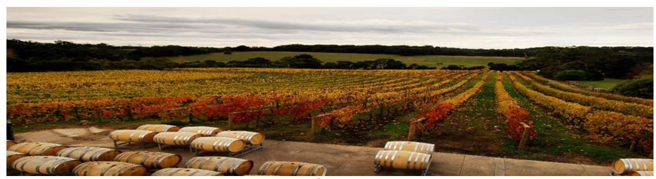
Morning Sun Vineyard

For the third and final tasting and some well-earned sustenance, we travelled a further kilometer along Main Creek Road to Morning Sun which is the latest addition to the Foxey's Hangout venues.